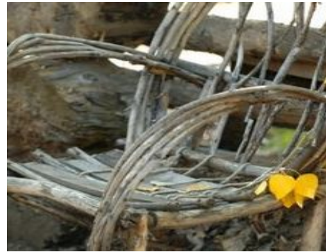
Bent Willow Furniture