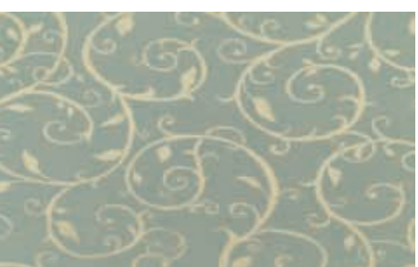
Cabaret Blue Haze