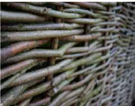
Wattle Edging & Panels