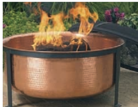
Hammered Copper Fire Pit