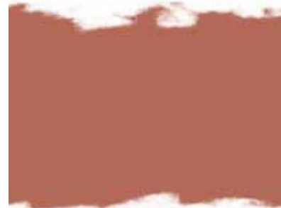
Baked Terra Cotta