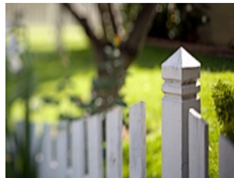
Rustic Picket Fence