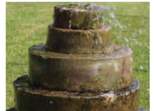
Antique Mill Stone Fountain