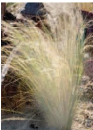
Mexican Feather Grass