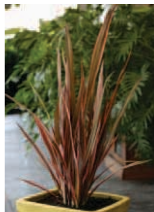
New Zealand Flax